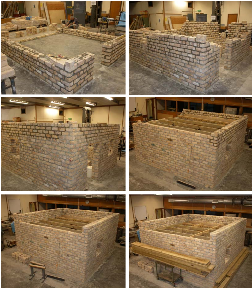
Figure 2: Construction of URM House 1